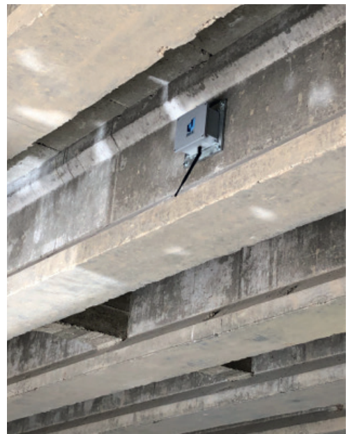
Esempio di Fissaggio a Muro con Piastra in acciaio (spessore 10 mm)