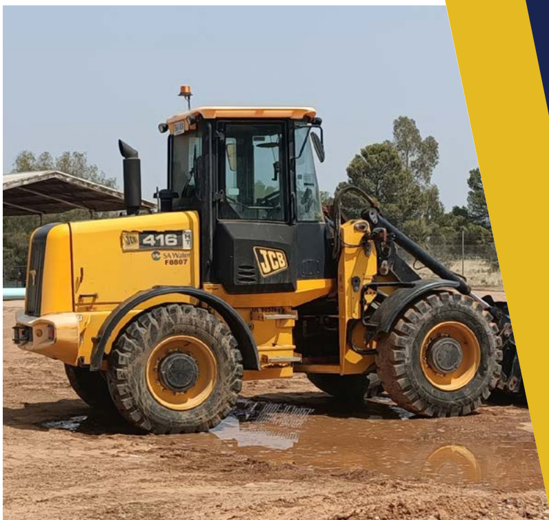
Front End Loader fitted with Weighing System

“Being uniquely independent with a solid focus on customer solutions, we source globally to supply nationally and locally.”