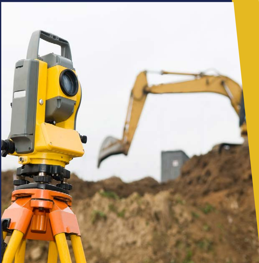
Total Station in use on site

Whether it's underground cable, pipe or asset location, Cody Corporation has the right Avoidance & Location tools for the job. We only supply leading brands trusted within the industry and provide Support & Calibration Services to back up your purchase. Cody Corporation also has a vast range of Underground Pipe Inspection Tools. From Domestic to Commercial Push Rod Systems and high end Robotic Pipe Inspection Crawlers we can guarantee you will have the right tools and training for your job.