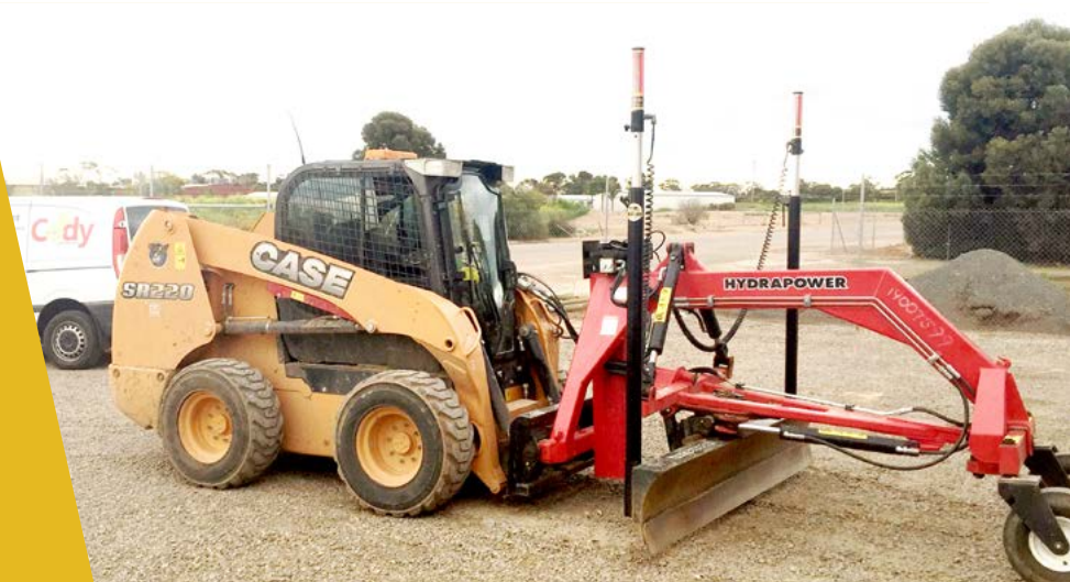
Skid Steer fitted with Grader and Laser Guidance attachment

Geoscience Australia – Increasing CodyRTK Signal Strength & increasing coverage to 99% of Australia.