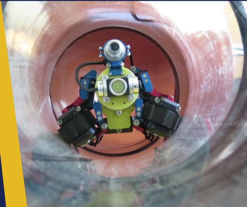
Pipe Inspection Camera in use