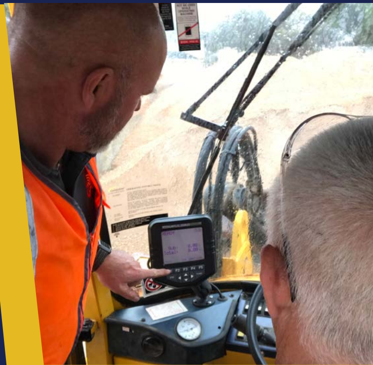
Training on Machine Control System