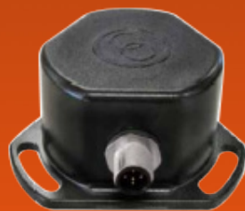
Dual Axis CANBUS Sensor, Pitch and Roll - to be mounted on truck

Compuload is the trusted name in On Board Weighing. Established in 1988 we are privately owned Australian company who design, manufacture and distribute the quality Compuload On Board Weighing products throughout Australia and Export markets. Our aim is to offer quality products, dependable performance, reliable delivery and technical back up for all your weighing requirements.